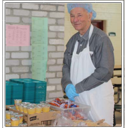
At left, students at J.A. McDougall School in downtown Edmonton patiently wait in line for lunch served by E4C staff and volunteers.