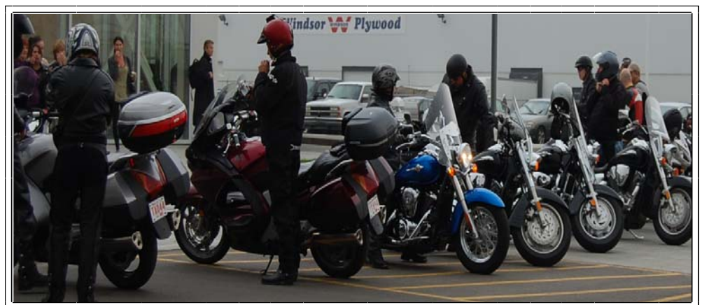
Photo: riders gear up for the event.

The REALTORS® Community Foundation continues their ongoing support of E4C with a donation of $18,647. The proceeds are from Ride for Kids , the association's annual motorcycle charity ride, which was started in 2005 by motorcycle-riding realtors.