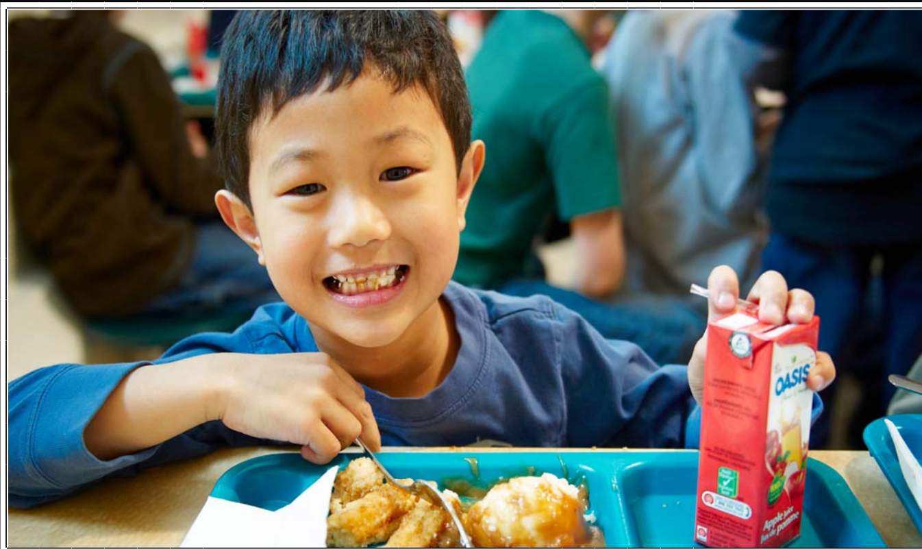
The smiles on their faces says it all.

And every day, with the help of generous donations from people like you, E4C's School Lunch and Snack Program feeds lunch to 2000 children, and a nutritious mid-morning snack to over 5500 children in high needs schools.