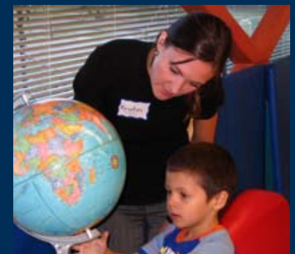
Learning at Clareview Head Start